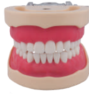
COLUMBIA® TYPE TYPODONT 32 threaded teeth/ Articulator. Ref.0905000-9