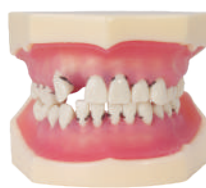
PERIODONTICS MODEL 32 threaded teeth/ Screwdriver. Ref.0905109