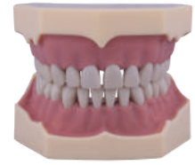
TIPODONT TIPO FRASACO® AG-3 32 threaded teeth/ Free screwdriver. Ref.0905000