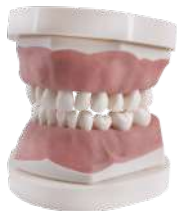
TYPODONT TYPE FRASACO® AK-6 24 threaded teeth/ Screwdriver/ Base plate. Ref.0905000-8PB