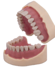
FRASACO® TYPE TYPODONT ANA-4 28 threaded teeth/ Screwdriver. Ref.0905000-5