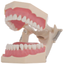
FRASACO® AG-3 TYPODONT 32 threaded teeth/ Articulator/ Screwdriver. Ref.0905100