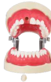
ENDO TYPODONT 28 threaded teeth/ Articulator and plates. Ref.0905127