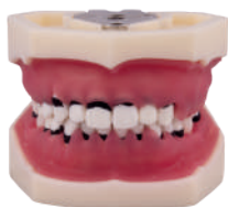
FRASACO® TYPE TYPODONT AK-3 24 threaded teeth/ Screwdriver/ Base plate. Ref.0905125