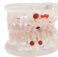
MODEL TRANSPARENT CARIES 32 teeth/ Demonstration model to know possible cases. Ref.0905115