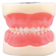
TYPODONT NISSIN® TYPE 24 threaded teeth/ Free screwdriver. Ref.0905000-3