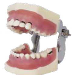
PERIODONTIC TYPODONT WITH ARTICULATOR 28 threaded teeth/ With articulator/ Base plate. Ref.0905110