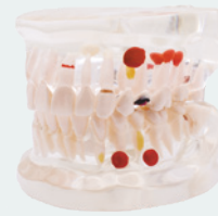
Transparent caries model

32 teeth Demonstration model to identify potential cases.