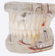
Implant with nerve

Demonstration model. Some removable teeth.