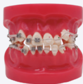
Metal Sapphire Bracket